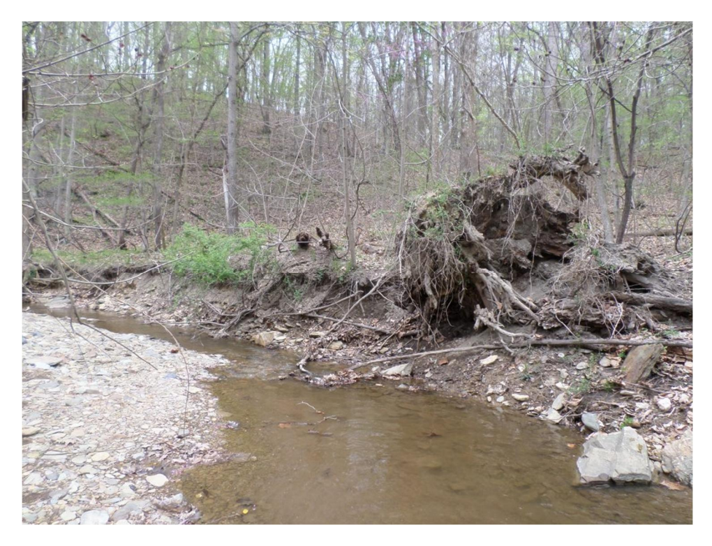
7. Moderate Erosion along Northwest Embankment (Note: Fallen Tree)