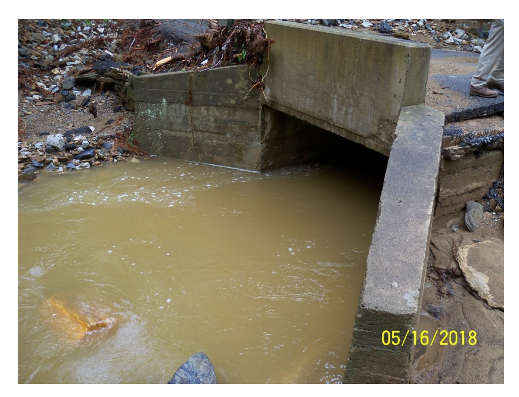
Structure 11-03 - Downstream