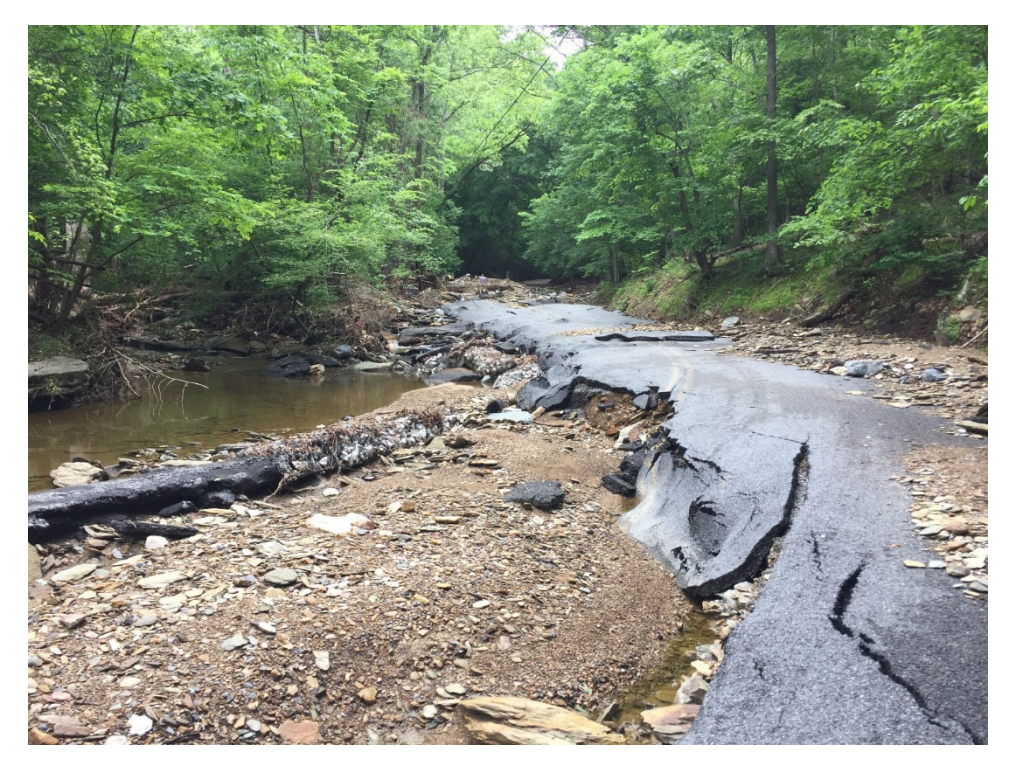
Exhibit 02 - Back Road Photos Post Storm Event