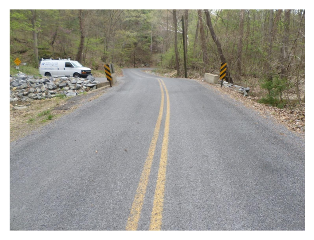
1. North Approach Looking South