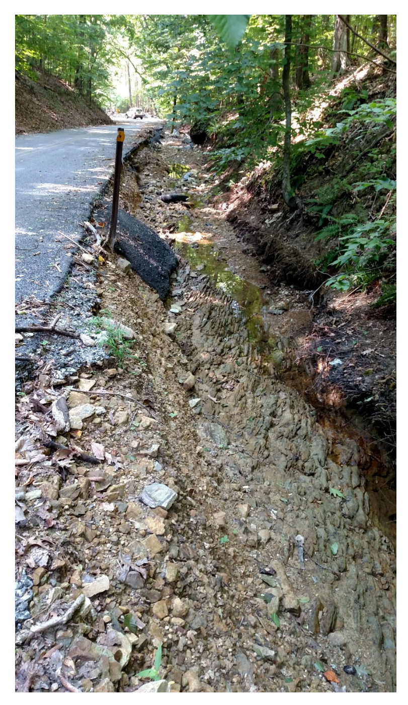
Back Road – Shoulder Repairs