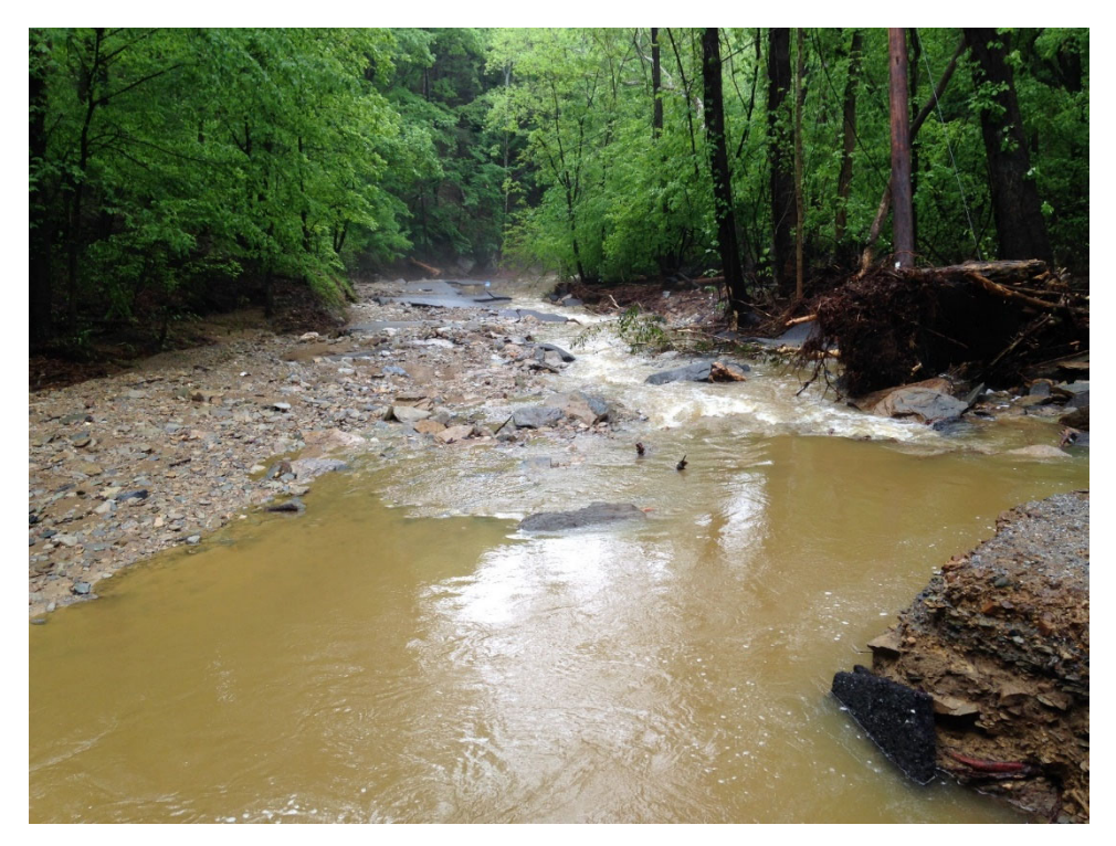
Back Road Looking South – From Structure 11-03