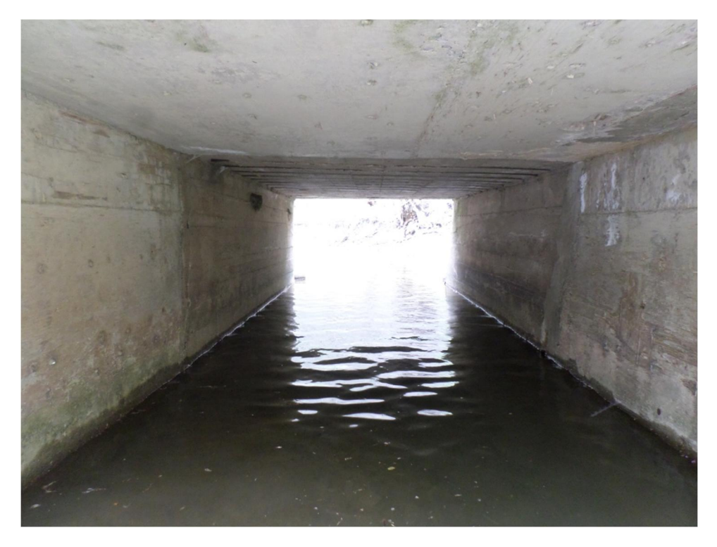
5. Typical Underside of Structure Looking West