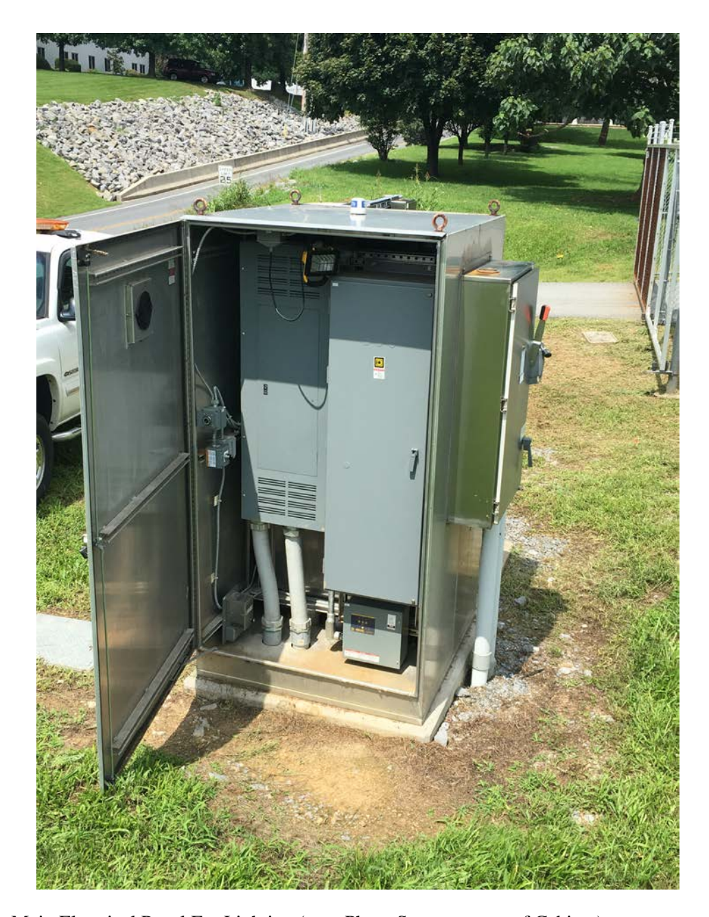
Photo 1: Main Electrical Panel For Lighting (note Photo Sensor on top of Cabinet)