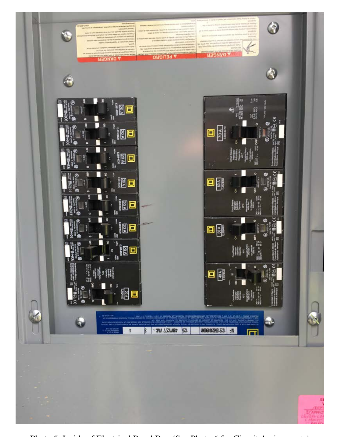
Photo 5: Inside of Electrical Panel Box (See Photo 6 for Circuit Assignments)