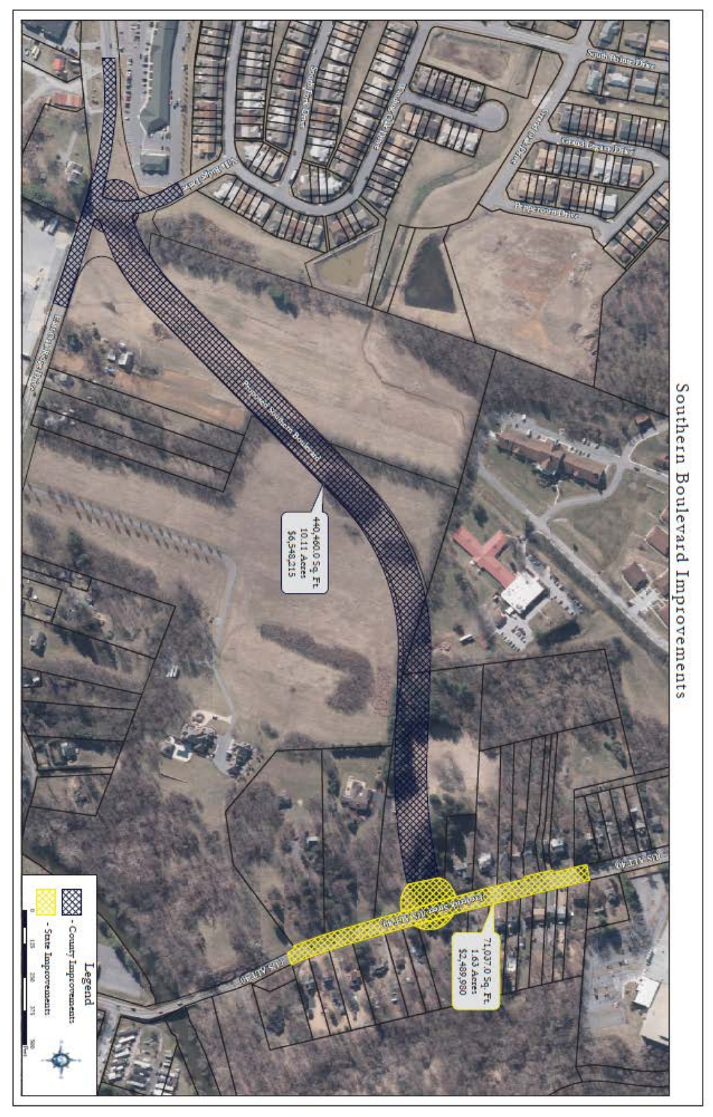
Exhibit Number 1