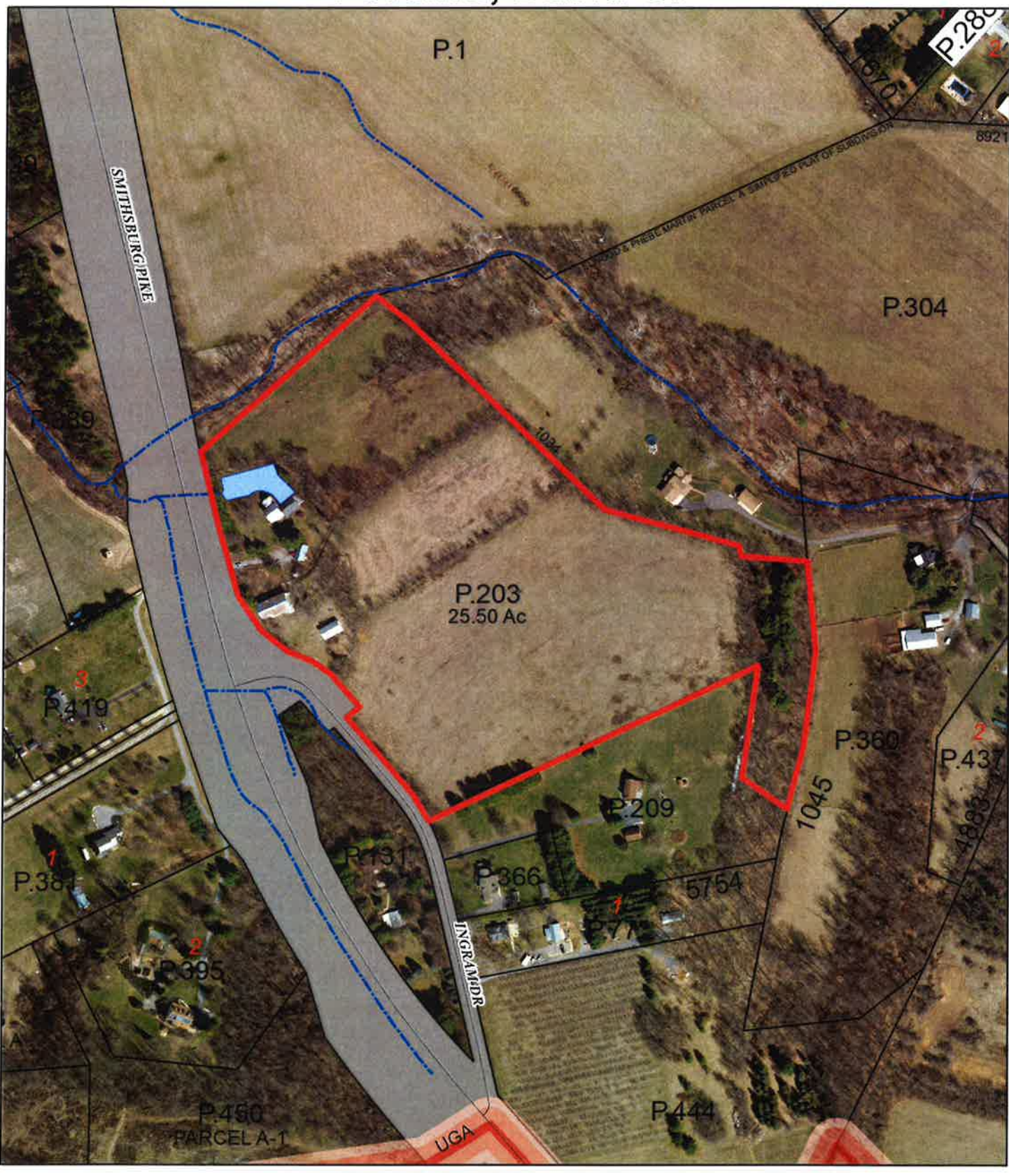
13215 Smithsburg Pike Smithsburg, MD 21783

WARNING! This map is for internal use by the Washington County Planning Department, it is not for general distribution to the public, and should not be scaled or copied. Sources at the data contained hereon are from various public agencies which may have use restrictions and disclaimers. The parcel lines shown on this map are derived from a variety of sources which have their own accuracy standards. The parcel lines are approximate and for informational purposes CNIV. They are not guaranteed by Washington County Maryland or the Maryland peartment of Assessments and Taxsions to be rised or errors including errors of omission, commission, positional accuracy or any attributes associated with real property. They shall not be copied, reproduced or scaled in any vay without the express prior writing approval of Washington County Maryland Planning and Zoning Department, This data DCES NOT replace an accurate survey by a licensed professional and information shall be venified using the relevant deeds, plats and other recorded legal documents by the user.