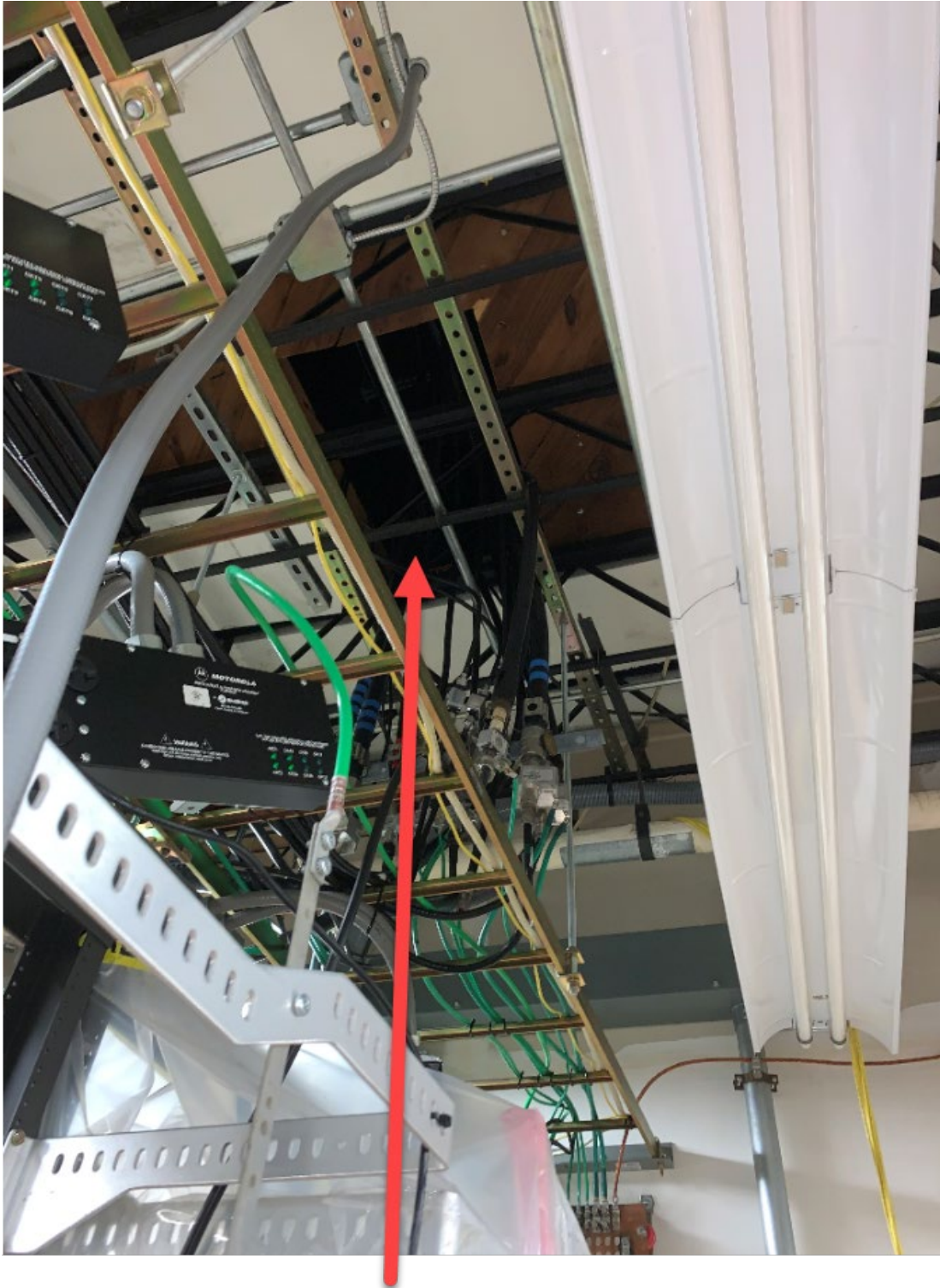
Fourth Floor Server Room Qwikport Access