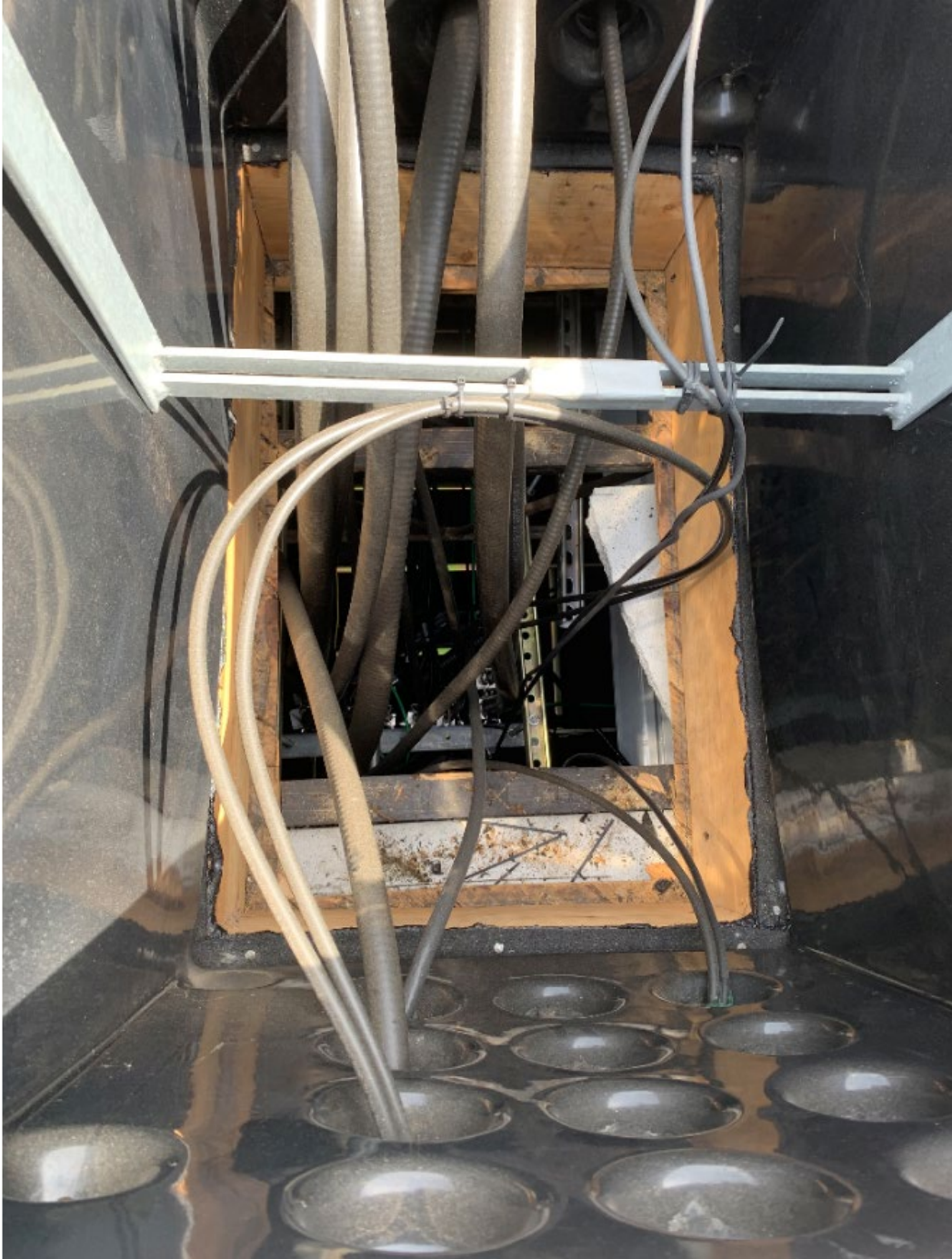
Looking through Qwikport Access to Fourth Floor Server Room