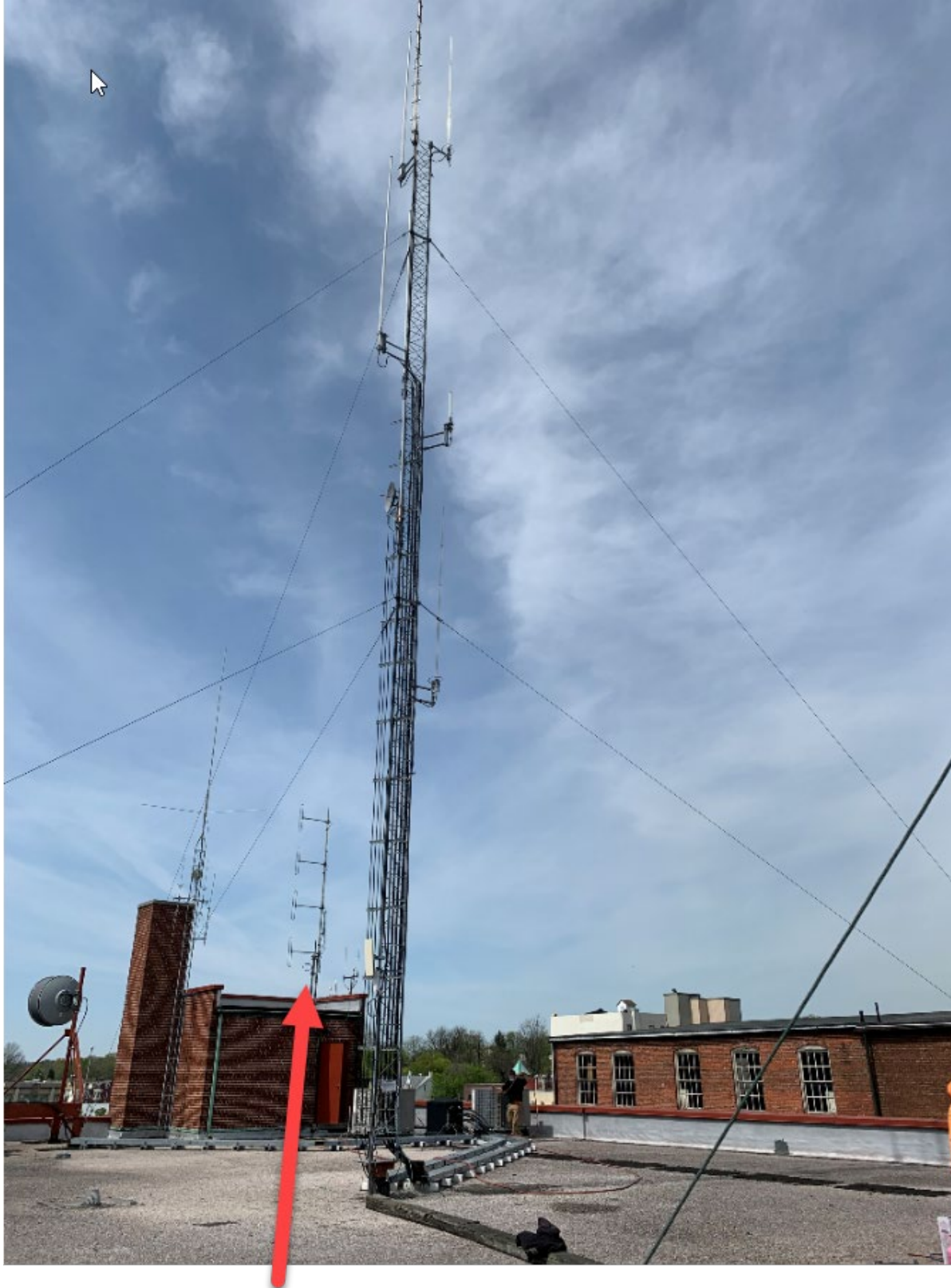
Elevator Shaft Antenna