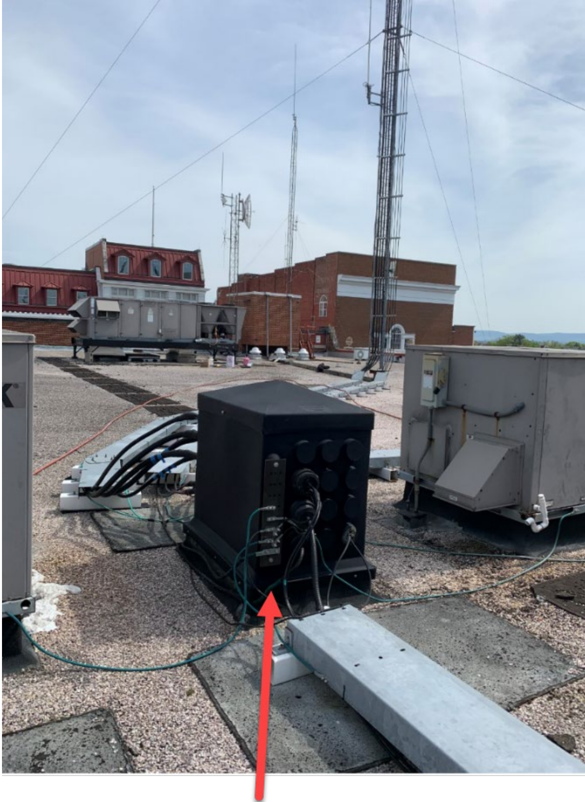
Qwikport Access on rooftop