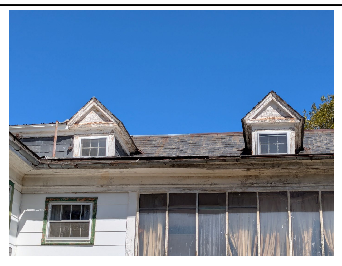
Photo 11 of 12: Southside roof dormer above enclosed porch, camera facing north

Location: 1230 Mount Aetna Road, Hagerstown, MD 21740