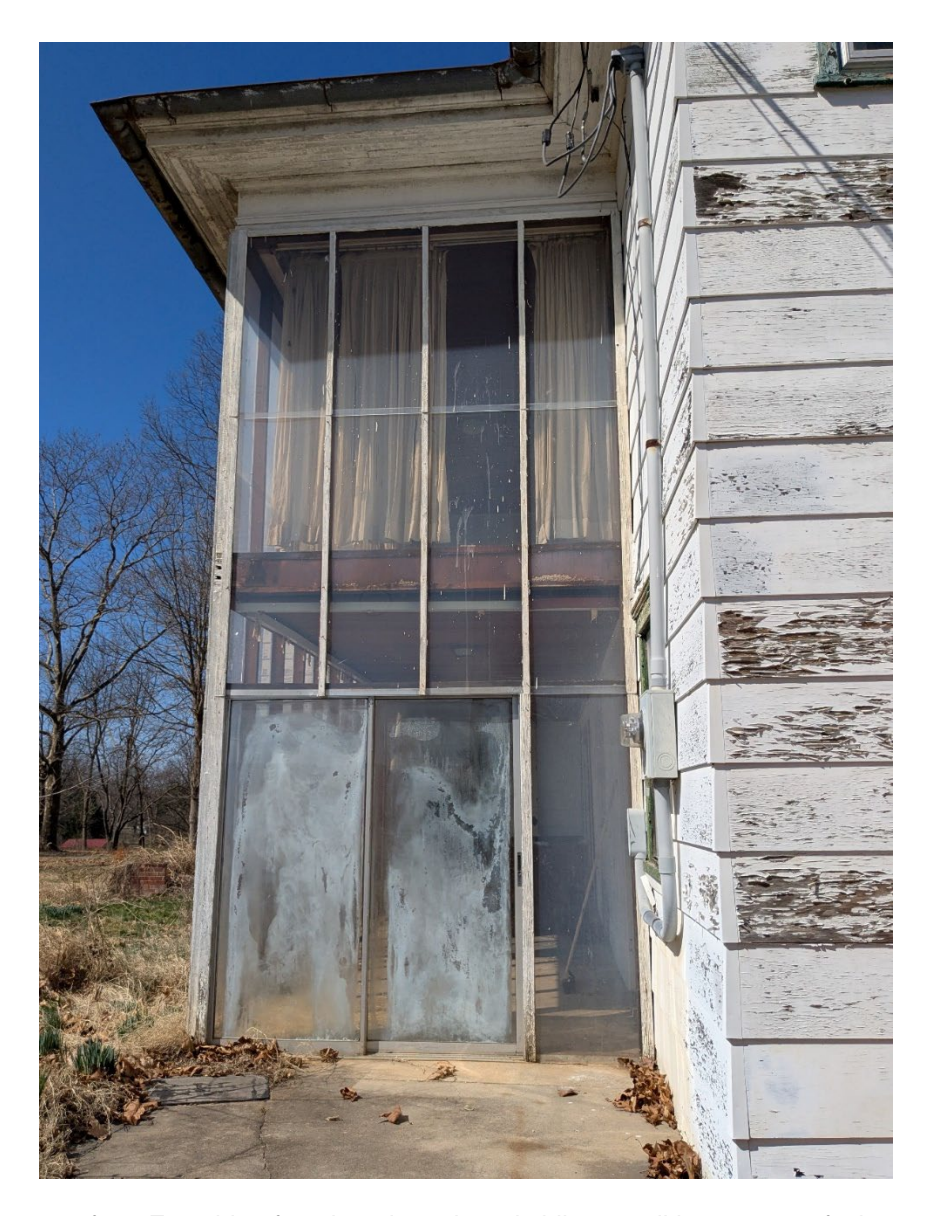
Photo 9 of 12: Eastside of enclosed porch and siding condition, camera facing west

Location: 1230 Mount Aetna Road, Hagerstown, MD 21740