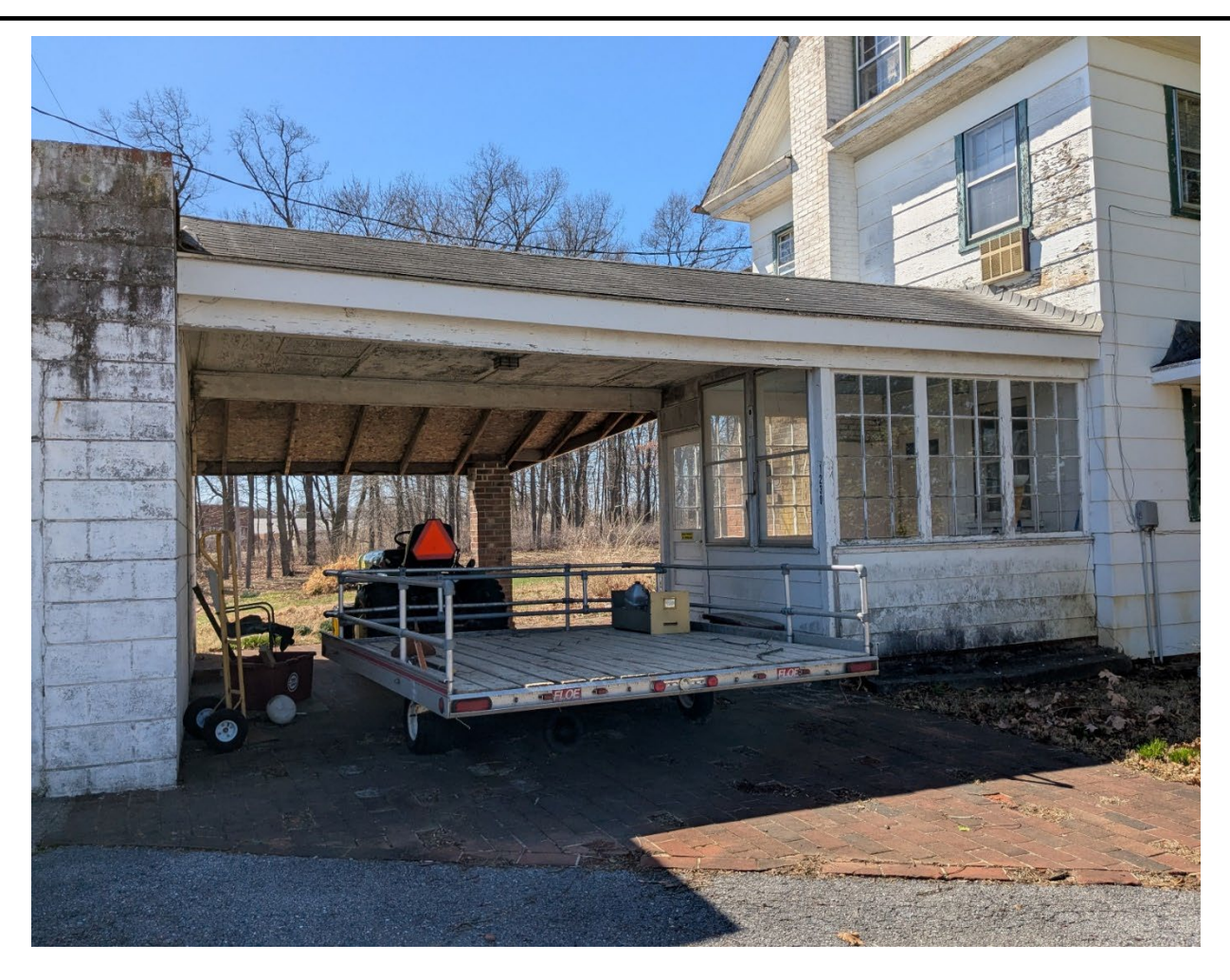
Photo 1 of 12: Northside of structure; connecting lean to for cinderblock garage, camera facing south

Location: 1230 Mount Aetna Road, Hagerstown, MD 21740