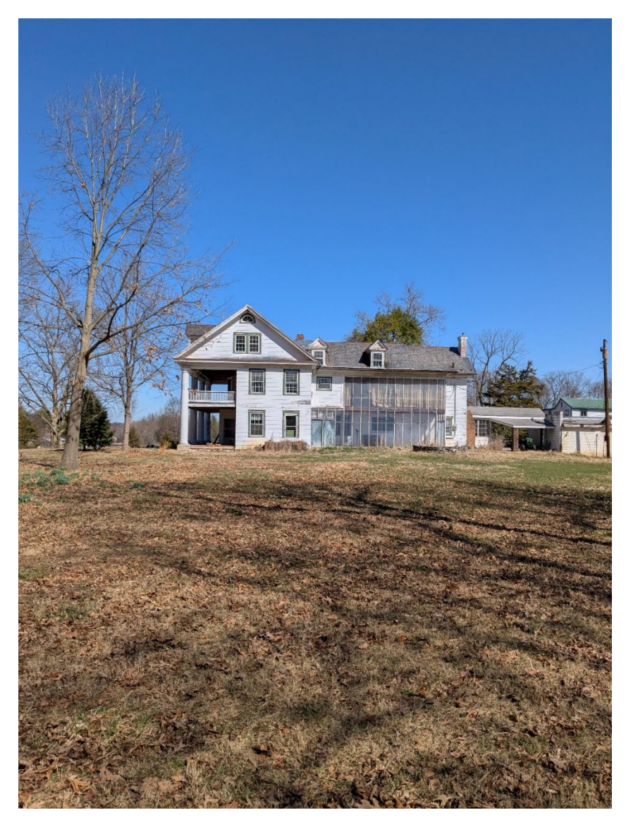
Photo 8 of 12: Southside of structure, enclosure of 2-story porch, camera facing North

Location: 1230 Mount Aetna Road, Hagerstown, MD 21740