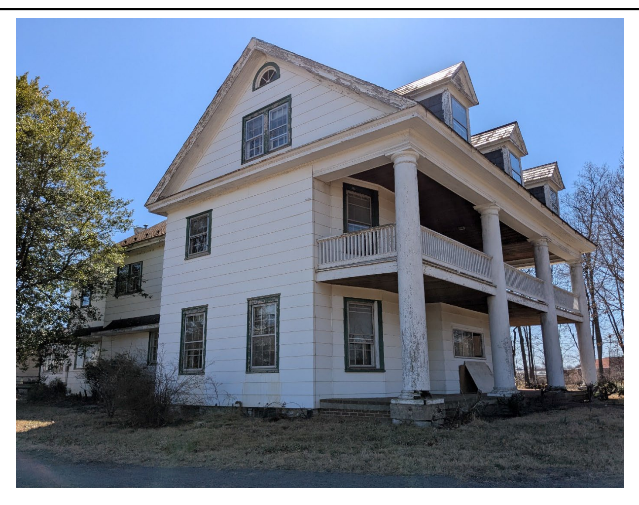
Photo 5 of 12: Northside of structure, front (west) porch, camera facing southeast

Location: 1230 Mount Aetna Road, Hagerstown, MD 21740