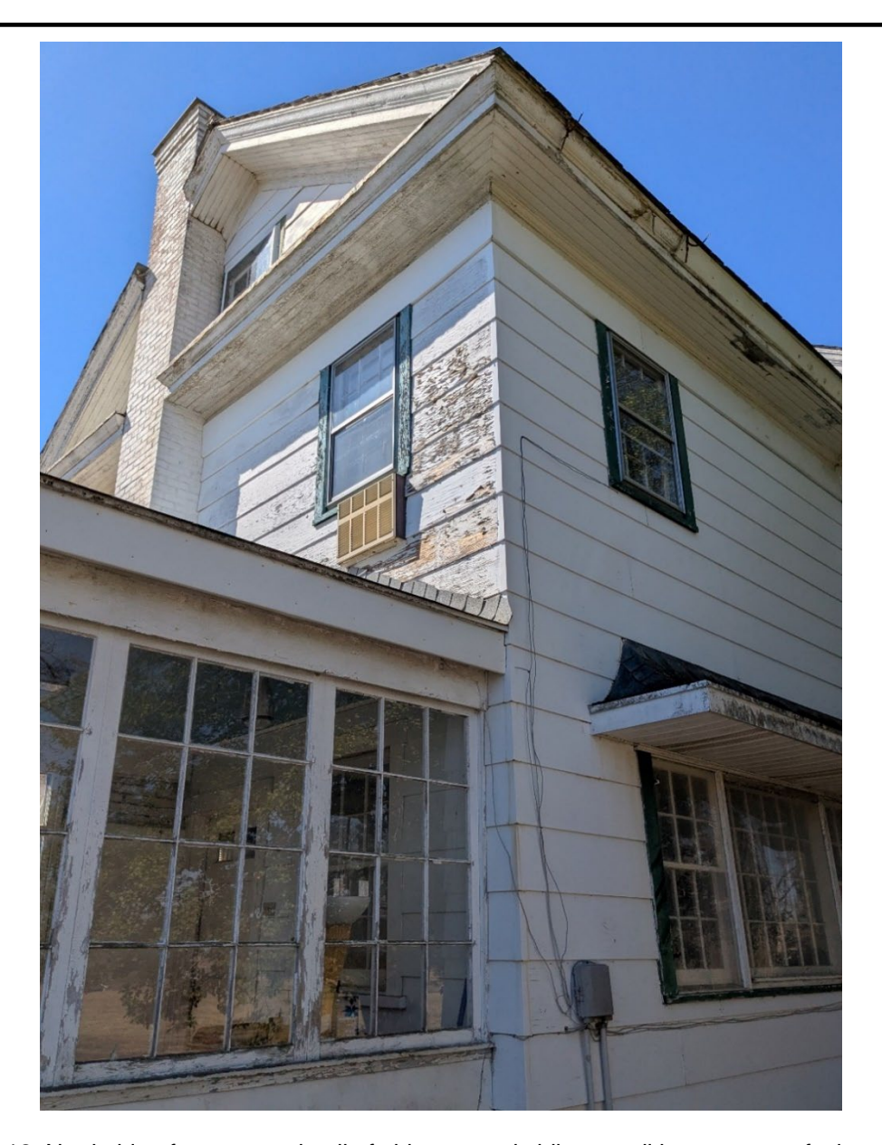
Photo 2 of 12: Northside of structure, detail of chimney and siding conditions, camera facing southwest

Location: 1230 Mount Aetna Road, Hagerstown, MD 21740