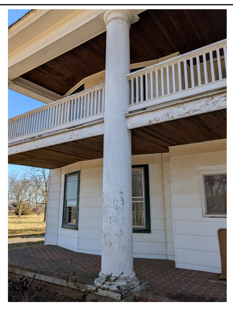
Photo 7 of 12: Close up of column on front (west) porch, camera facing northwest

Location: 1230 Mount Aetna Road, Hagerstown, MD 21740