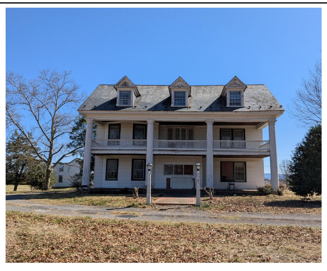
Photo 6 of 12: West side of structure, front entrance, camera facing east

Location: 1230 Mount Aetna Road, Hagerstown, MD 21740