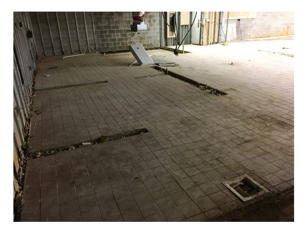
Existing Conditions Photo No. 4