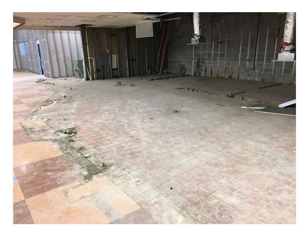
Existing Conditions Photo No. 2