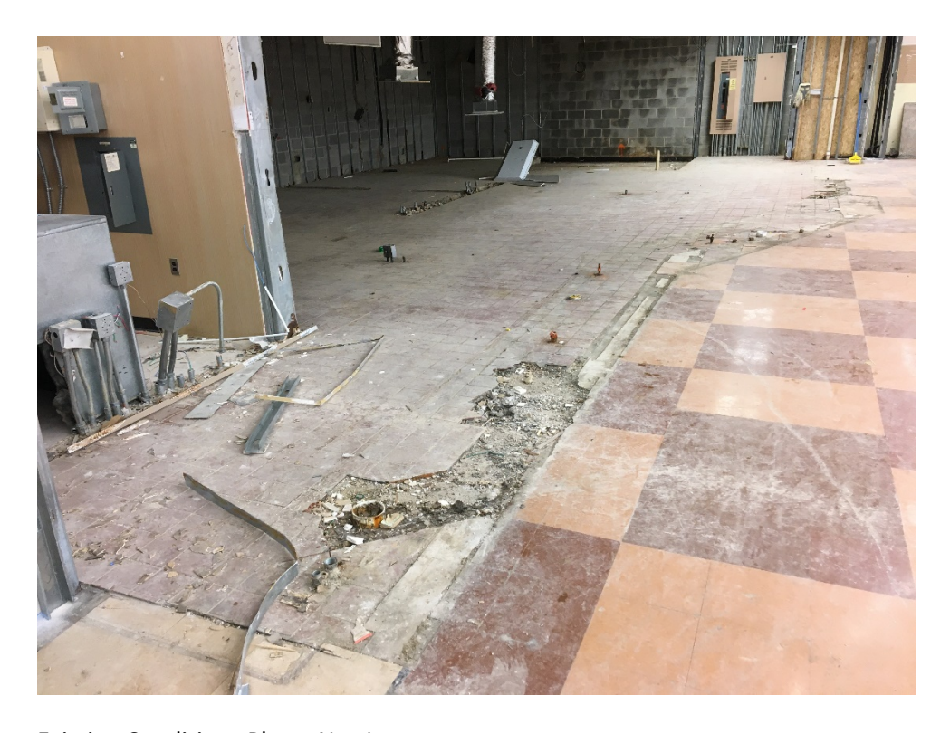
Existing Conditions Photo No. 1