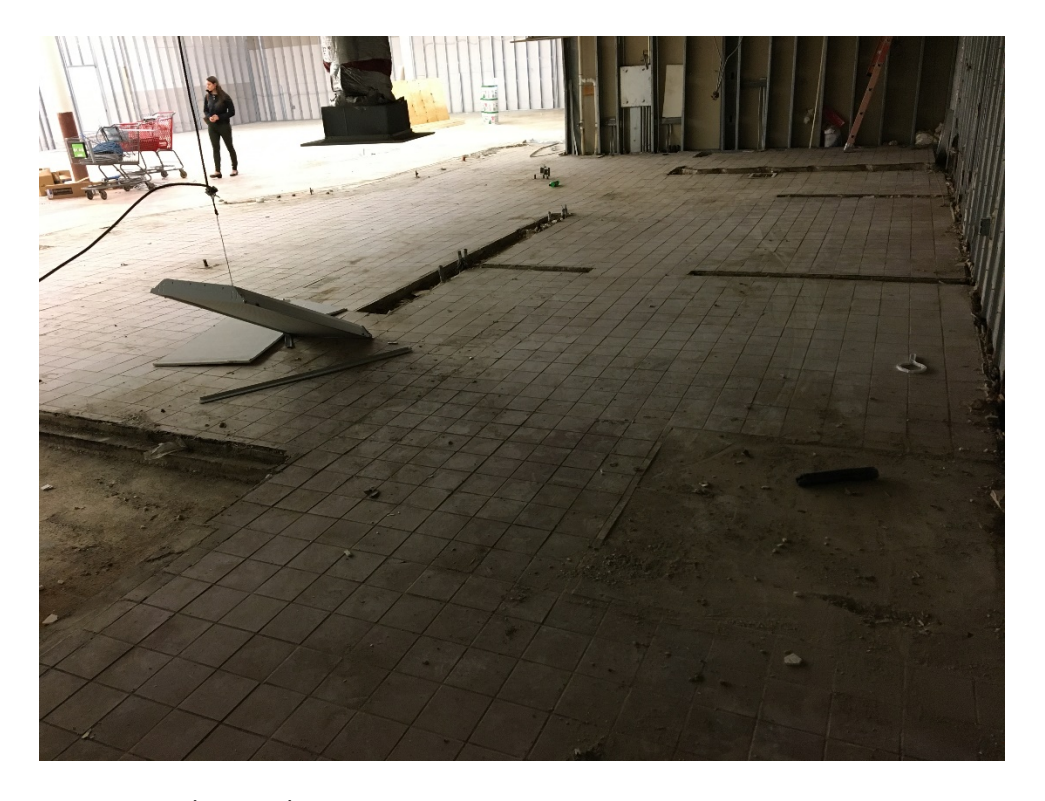
Existing Conditions Photo No. 3