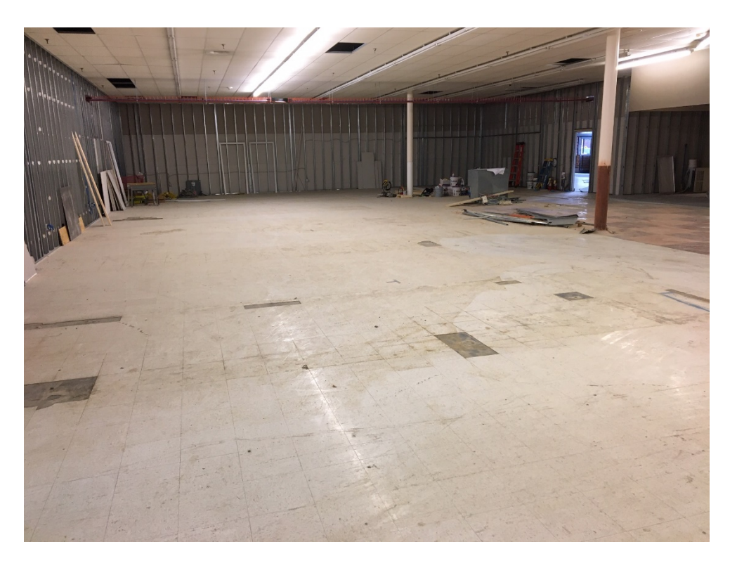
Existing Conditions Photo No. 1