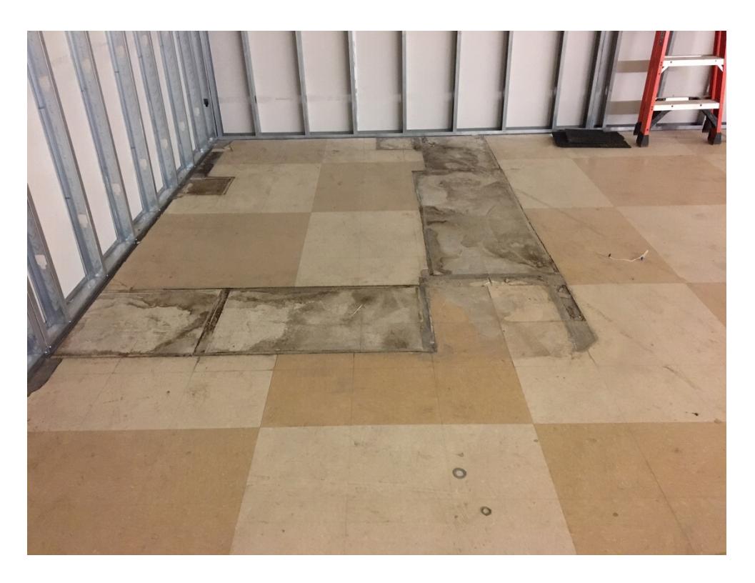
Existing Conditions Photo No. 3