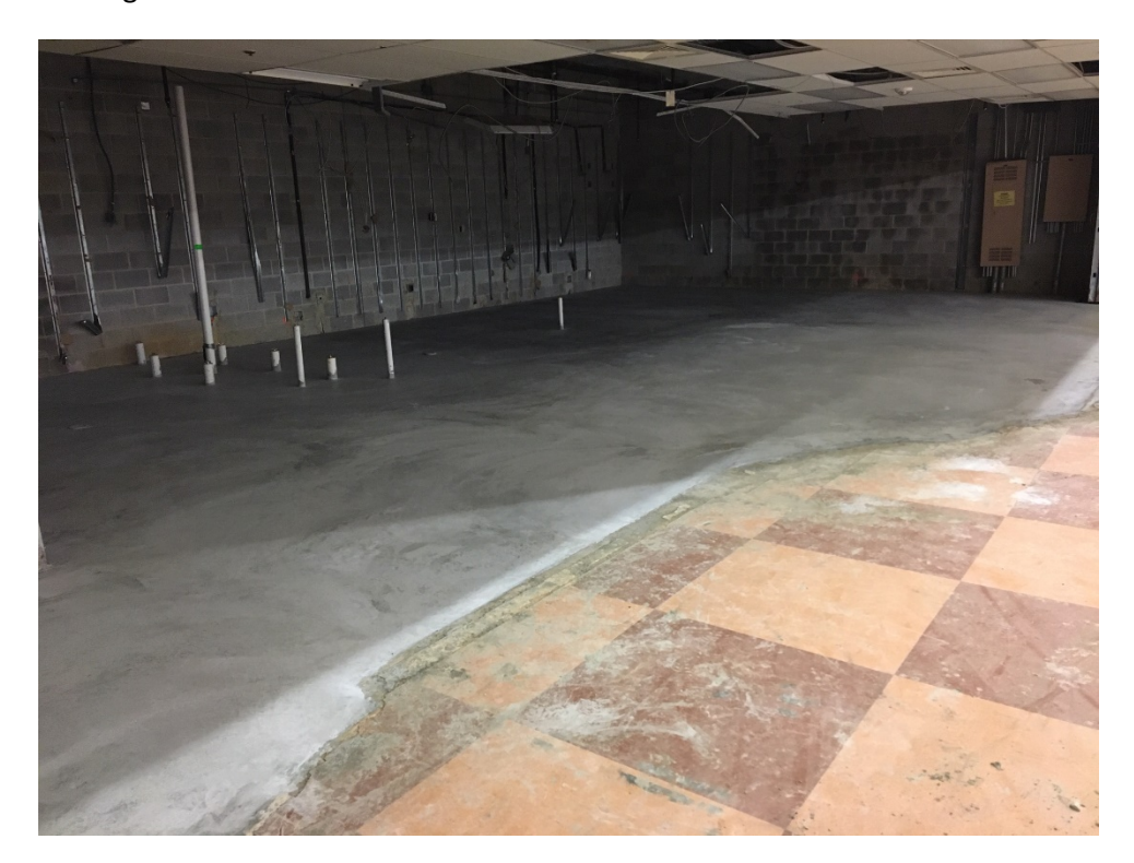
Existing Conditions Photo No. 4