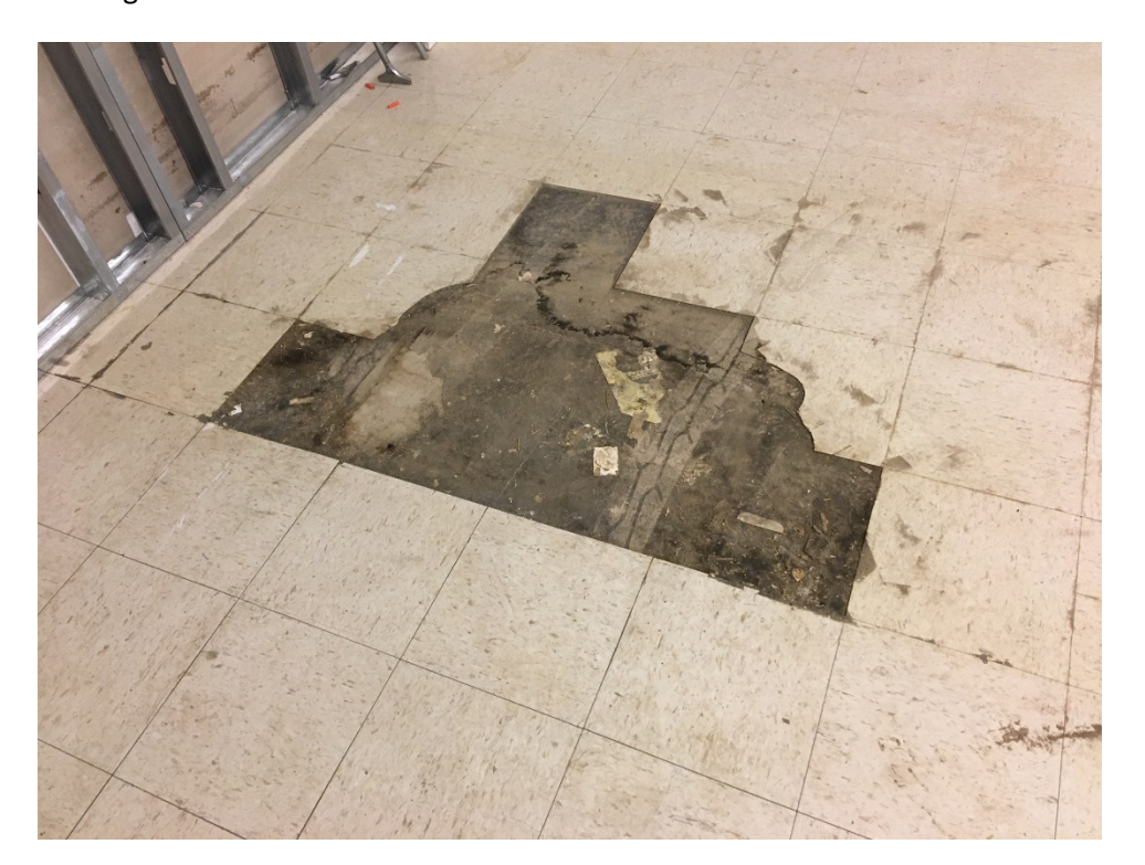
Existing Conditions Photo No. 2