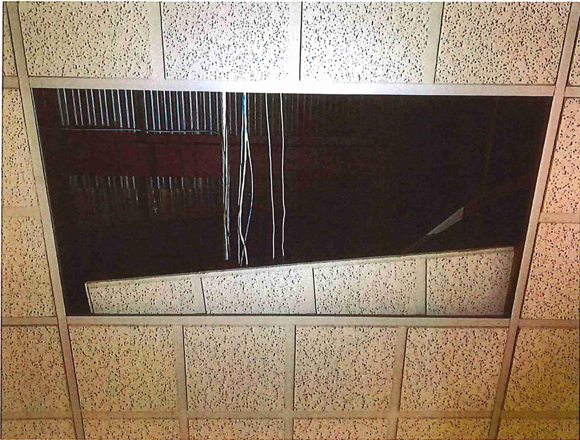
Photo of Ceiling Area Directly Above Proposed Door